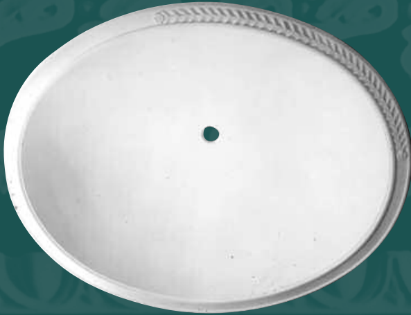
3464(A) Inside 52 × 62" 1.32 × 1.57 m Outside 59 1/2 × 69 1/2" 1.51 × 1.77 m Oval Dome Depth 18 1/2" 470 mm

Available with or without a laurel leaf rim inset: 3464 has a plain rim, 3464A includes laurel inset