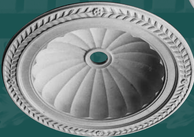
3466 Inner Diam 25 1/2" 648 mm Outer Diam 35" 889 mm Depth 6 1/2" 165 mm