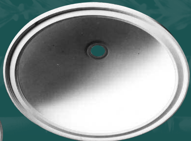
3462 Inner Diam 36" 914 mm Outer Diam 42" 1067 mm Depth 13 1/2" 343 mm