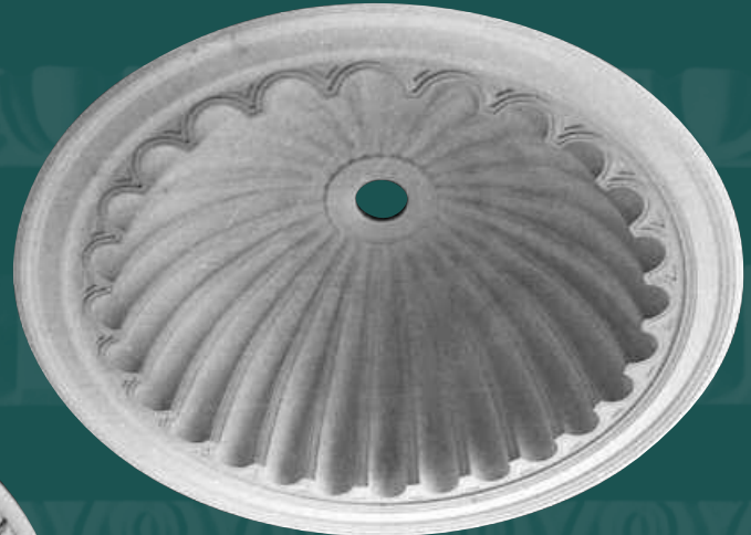
3463 Inner Diam 36" 914 mm Outer Diam 42 1/2" 1080 mm Depth 13 1/2" 343 mm

Please note that the depth specified for each dome is the required framing depth of the dome (ie. the distance from the ceiling surface to the top back surface of the dome.) The diameter of the rough opening required for the dome is approximately the average of the inner and outer diameters.