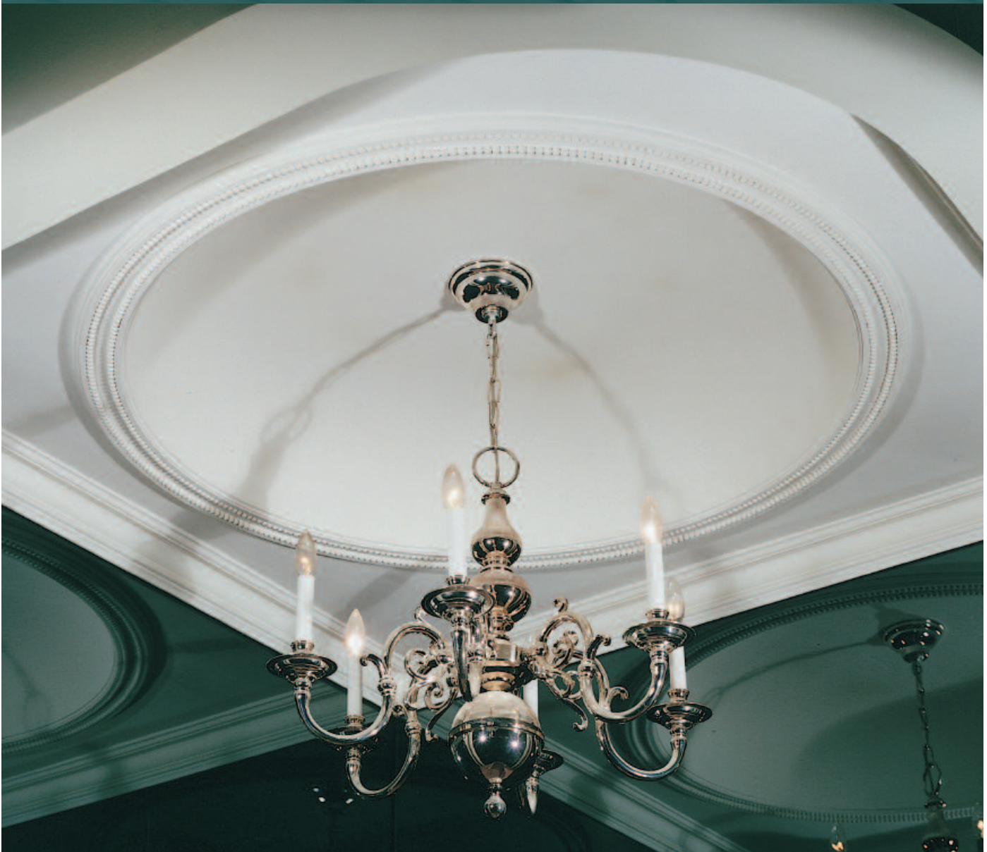
3465 / 3601 Gypsum Cement Ceiling Dome