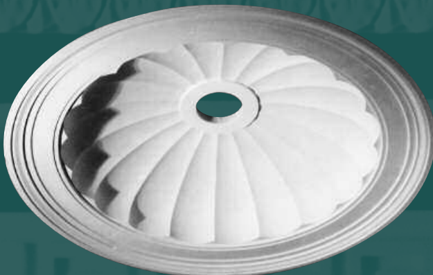
3461 Inner Diam 25 1/2" 648 mm Outer Diam 32" 813 mm Depth 6 1/2" 165 mm